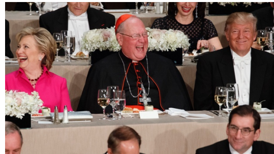
Hillary Clinton and Donald Trump attend the Al Smith Dinner (2016)