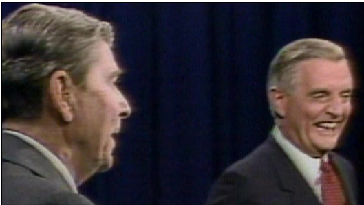
Ronald Reagan addresses the age issue (1984)