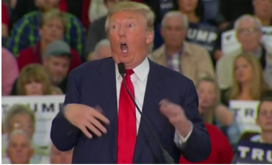
Donald Trump mocks a disabled reporter (2015)