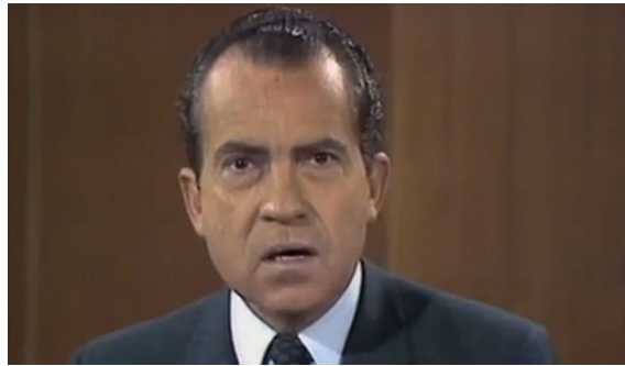
Richard Nixon says "Sock it to me?" on Rowan & Martin's Laugh-In (1968)