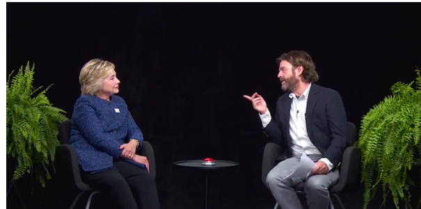
Hillary Clinton goes on Between Two Ferns (2016)