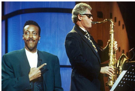
Bill Clinton plays sax on Arsenio Hall (1992)