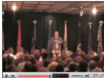
John McCain makes "Bomb Iran" joke (2007)