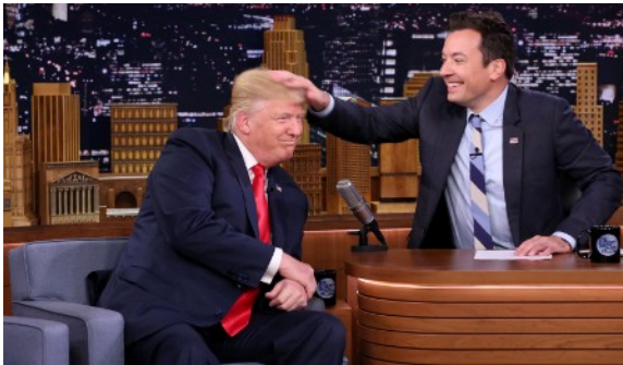
Jimmy Fallon ruffles Donald Trump's hair (2016)