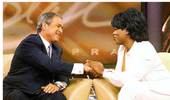
George W. Bush goes on Oprah (2000)