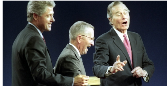
Ross Perot laughs during a debate (1992)