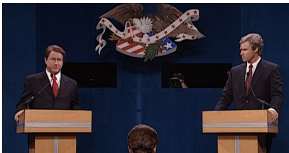
SNL parodies the first Bush-Gore debate (2000)