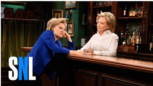
Hillary Clinton makes a cameo on SNL (2016)