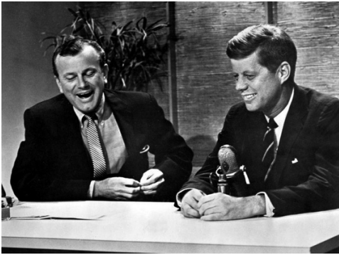
John F. Kennedy goes on the Jack Paar Show (1959)