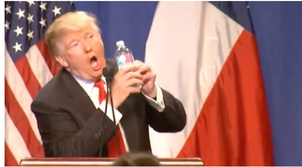
Donald Trump makes fun of Marco Rubio (2016)